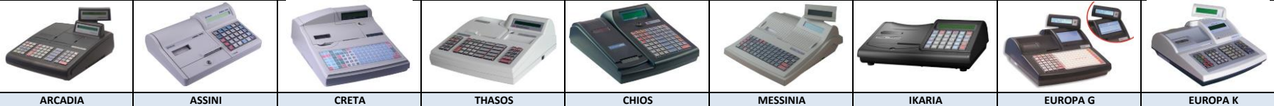
ARCADIA ASSINI CRETA THASOS CHIOS MESSINIA IKARIA EUROPA G EUROPA K